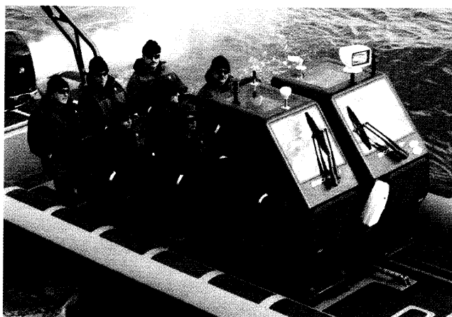
Shockwave technology for crew onboard MACH II.