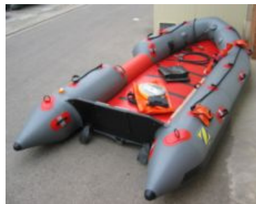
The Minuteman with RAD is fully equipped