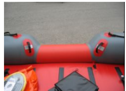
Zodiac's patent pending Rapid Access Door