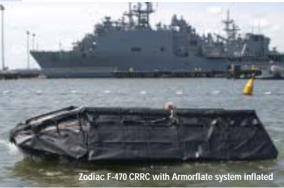
Zodiac F-470 CRRC with Armorplate system inflated