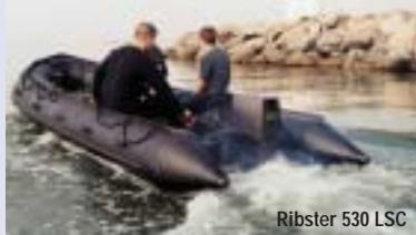
Ribster 530 LSC

Order the Ribster 530 LSC with GSA p/n 280204.