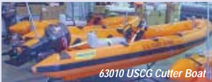
63010 USCG Cutter Boat