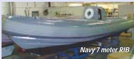
Navy 7 meter RIB