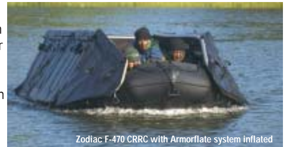
Zodiac F-470 CRRC with Armorplate system inflated

For more information, please contact Rick Scriven at 410-643-4141 ext. 3008 or rscriven@zna.zodiac.com